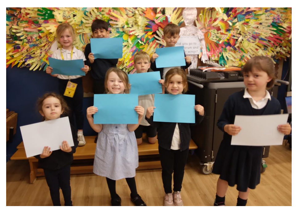
Caring and Kind Flock Stars