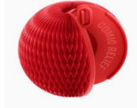
THE RED NOSE

If you would like to donate for comic relief, please follow the link below: