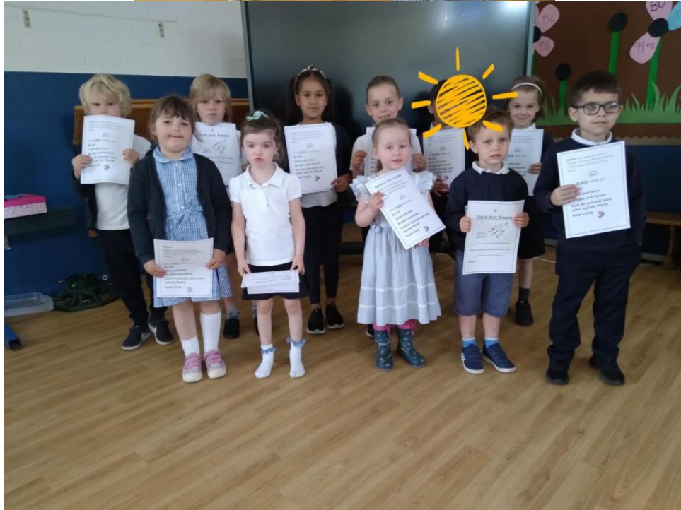
Listen and Learn like Louis the Lark